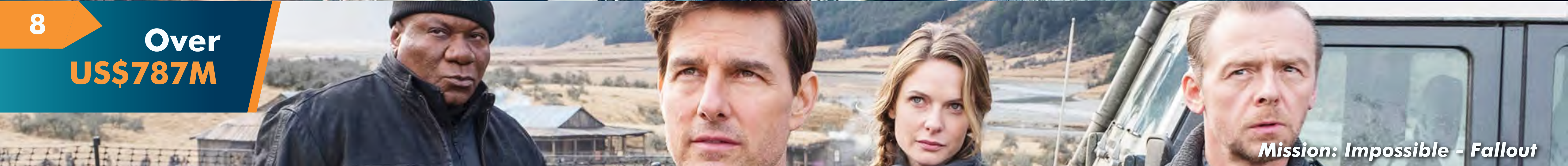
Mission: Impossible - Fallout