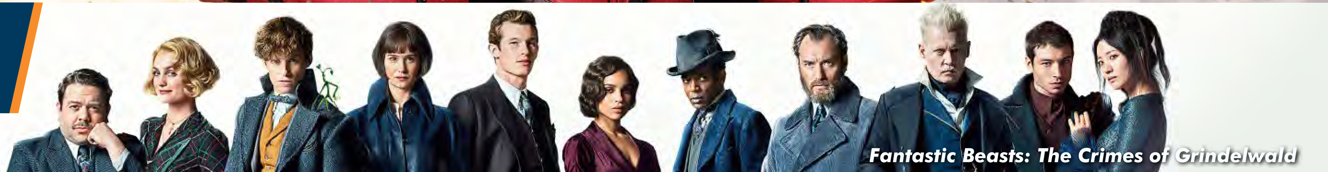
Fantastic Beasts: The Crimes of Grindelwald