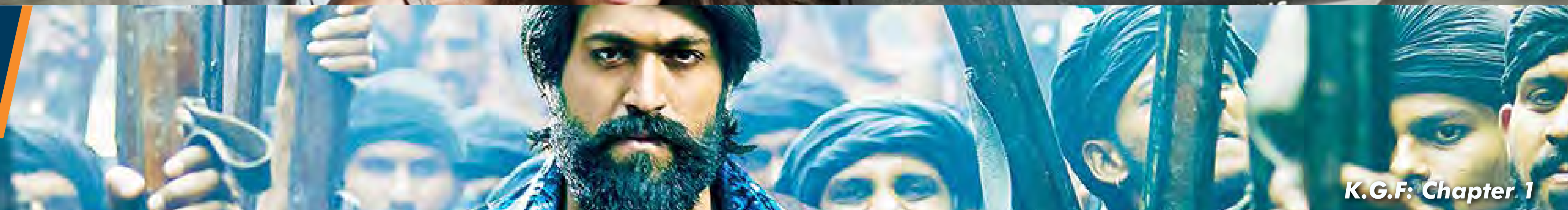
K.G.F: Chapter 1