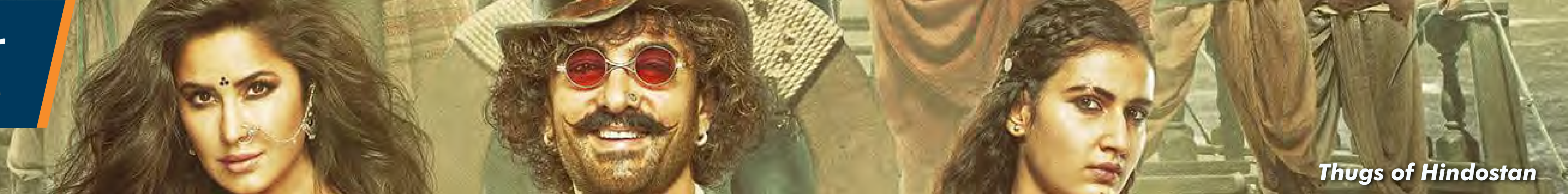
Thugs of Hindostan