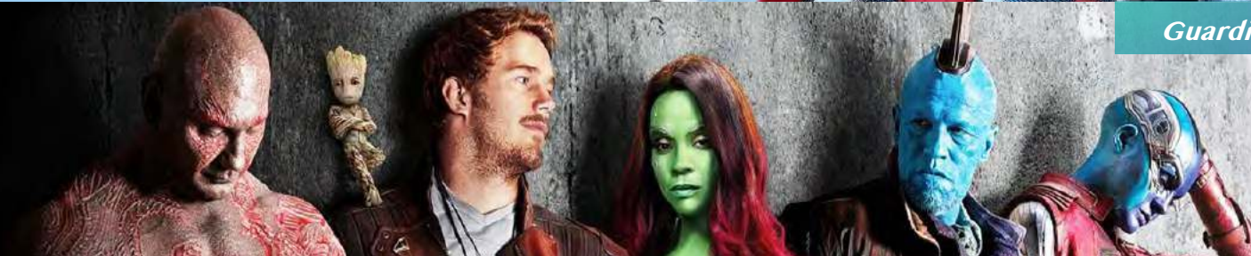
Guardians of the Galaxy Vol. 2